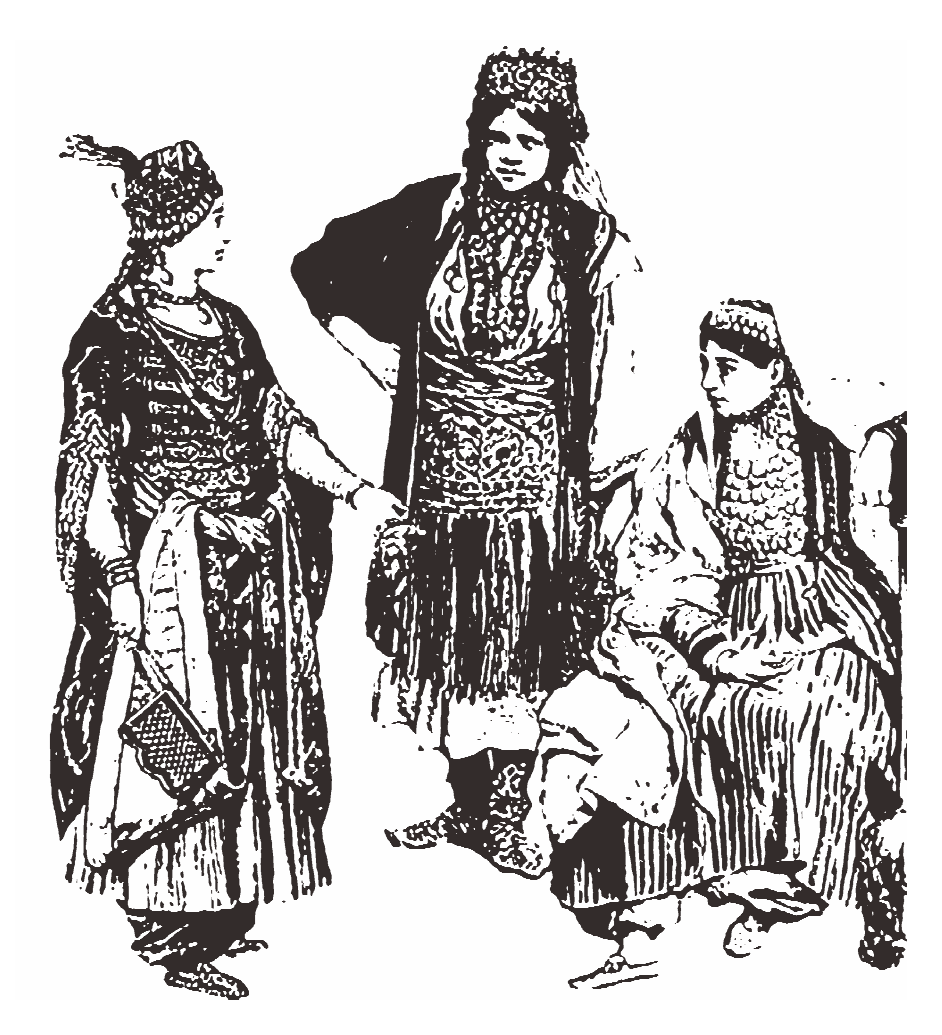
\label{eq:Figure 1} \mbox{Illustration of $\textit{Bacıyan-ı Rum}$ women}^{25}

By the 14th century, Sisters living in Ankara and its villages were spinning Angora wool to make threads sell them in sure bazaars.<sup>26</sup> Several foreign