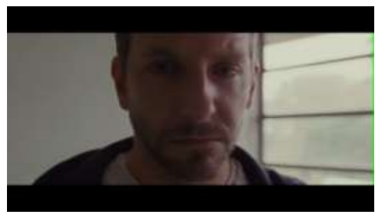
Figure 2: Pat's expression in Silver Linings Playbook (00.01.13)

In figure 1, Pat as a mental disorder character is represented by wearing abnormal and unacceptable clothes because it is considered strange. He wears a garbage bag that covers his clothes when he exercising and a jersey as a formal dinner outfit. Pat was aware his clothes were not normal, but that made Pat look weird. So, the outfit of mental disorder character is still in dominant stereotype in the form of strange and abnormal.