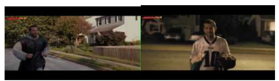
Figure 1: Pat's Clothes in Silver Linings Playbook (00.37.00) and (00.22.58)

In figure 1, Pat as a mental disorder character is represented by wearing abnormal and unacceptable clothes because it is considered strange. He wears a garbage bag that covers his clothes when he exercising and a jersey as a formal dinner outfit. Pat was aware his clothes were not normal, but that made Pat look weird. So, the outfit of mental disorder character is still in dominant stereotype in the form of strange and abnormal.