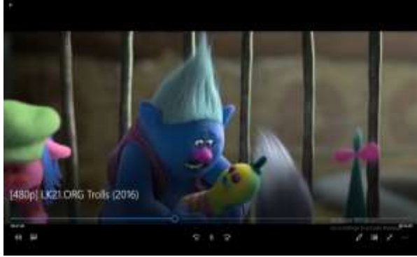
Figure 3. denotation in blue

Denotation of the gray color when viewed in terms of a signifier combination of white and black, this color is the transition between two non-colors. The more concentrated gray, the more dramatic and mysterious it seems. Gray color when associated with a person's nature is often interpreted as calm, hard-working and tend to think about their own safety. While in terms of signified gray, Branch one of the characters from Trolls movie with the gray color's who have a negative attitude are not as cheerful as the other Trolls characters.