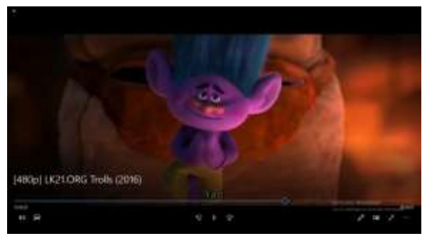
Figure 6. denotation from violet

Denotation from Violet is a unique color, mainly because it is rarely found in nature. The use of this color represents great hope and sensitivity. Besides that the color purple also has the meaning of wise, truthful, ambitious, positive and purple is also known to have a mystical aura meaning. Besides positive meanings the color purple also has a negative meaning namely betrayal and solitude. Purple is the skin color of the Creek character in the film Trolls.