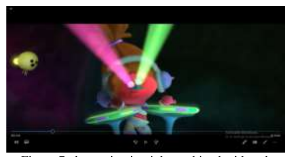
Figure 7. denotation in pink combined with red

Denotation from Violet is a unique color, mainly because it is rarely found in nature. The use of this color represents great hope and sensitivity. Besides that the color purple also has the meaning of wise, truthful, ambitious, positive and purple is also known to have a mystical aura meaning. Besides positive meanings the color purple also has a negative meaning namely betrayal and solitude. Purple is the skin color of the Creek character in the film Trolls.