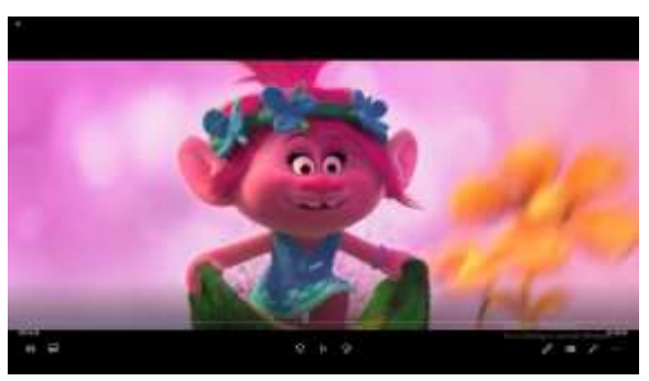
Figure 1. denotation in pink

This contains the process of analyzing data with several theories such as Barthes theory to get results to answer research questions. This research process will explain the denotation about the colors in each color in the characters in the film Trolls. Connotation expresses the hidden meaning behind the sign implicit in a matter. Denotation according to Berger is a special meaning contained in a sign and in essence can be called a description of a sign (Sobur 2003).