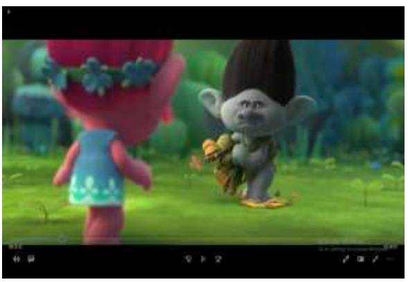
Figure 2. denotation in gray

Denotation of the gray color when viewed in terms of a signifier combination of white and black, this color is the transition between two non-colors. The more concentrated gray, the more dramatic and mysterious it seems. Gray color when associated with a person's nature is often interpreted as calm, hard-working and tend to think about their own safety. While in terms of signified gray, Branch one of the characters from Trolls movie with the gray color's who have a negative attitude are not as cheerful as the other Trolls characters.