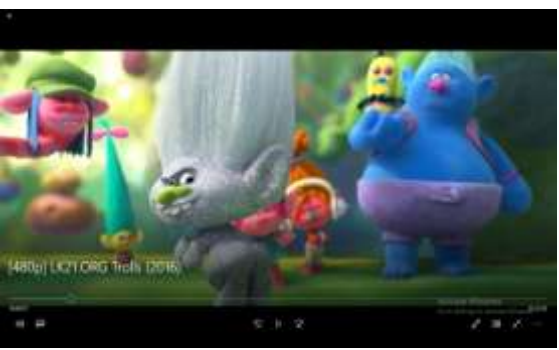
Figure 4. denotation in silver

Denotation of the silver color when viewed in terms of a signifier the silver itself, when viewed in terms of signified silver almost same with grey color, the silver color is specified as a symbol of glamorous and elegant, therefore usually something in silver is more likely to have an expensive value than other colors. Silver has a graceful, emotional, decisive and thoughtful meaning, Guy Diamond is one of the characters from the trolls movie who has a silver body with blue eyebrows and a green nose.