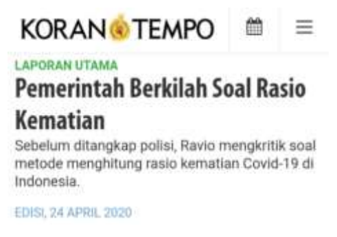
Figure 3. Headline of the 2nd news

The center of the headline in figure 2 is the clause "desak Pemerintah". Tempo's newspaper represent the government in this headline as the important parties in dealing with Covid-19, but the government seems underestimate this dangerous pandemic.