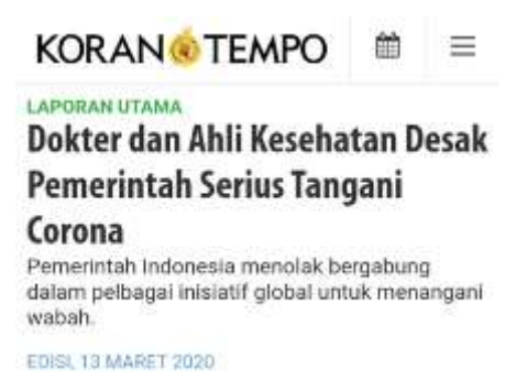
Figure 2. Headline of the 1st news

Here are some headlines that prove that Tempo.co reporting the news in accordance with the existing facts. Tempo prove that this media have no affiliated with the government. Thus, the news was presented without any pressure from the government.