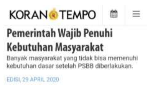
Figure 5. Headline of the 4th news

the field. Thus, the government's want to be seen working by the society by giving a social assistance without clarify the accurate data.