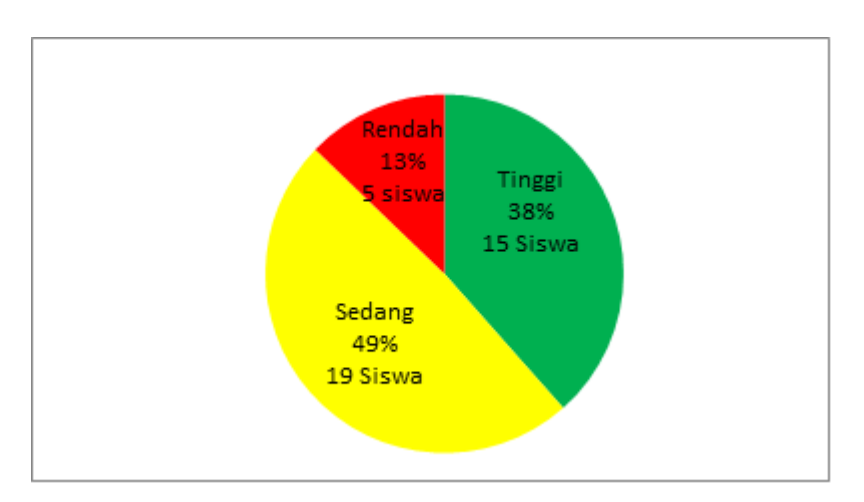
Figure 1. Survey Result of Student's Learning Motivation

Based on the result of the questionnaire, students' learning motivation during the covid-19 pandemic at MI Al Muslim showed a diversity of levels of motivation from students who had low learning motivation with 5 students or 13%, as many as 19 students or 49% having moderate learning motivation and as many 15 students or 38% have high learning motivation. The diversity of learning motivations during this pandemic is strongly influenced by several factors so that several problems arise with the diversity of student learning motivation because learning is carried out at the teacher's home as an educator is limited by space and time so that he cannot do what should be done to overcome this problem of diversity in learning motivation.