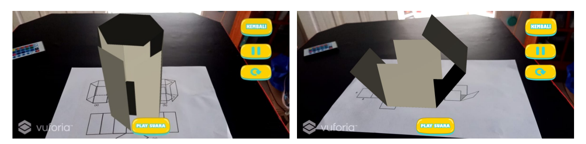
Figure 1. AR Display of Prism and Cube Nets

The implemented augmented reality geometry learning media are: (1) Augmented reality application in the form of the vuforia application which can be downloaded for free on Android smartphones on the link drivehttps://bit.ly/AugmentedRealityBRSD, the size of the application capacity is 60 MB. It looks like in Figure 1 and Figure 2.