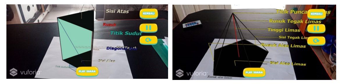
Figure 2. AR Display of Prism and Pyramid Elements