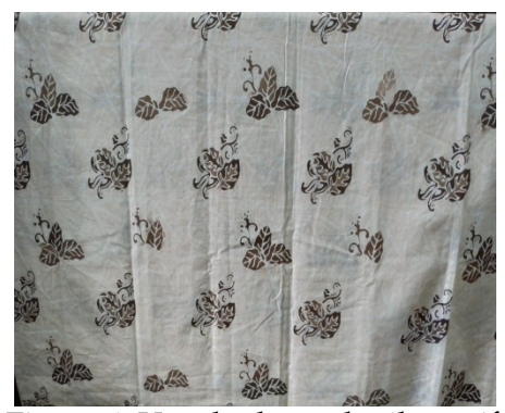
Figure 6. Usual tobacco batik motif

In tobacco batik motifs, mix and match with chrysanthemums, jasmine flowers, and other types of flowers. Because there are not too many motifs, so the colors are made in various ways that aim to follow fashion.