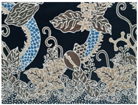
Figure 9. Tobacco coffee batik motif

In the tobacco batik motif which means prosperity. The tobacco coffee motif means the prosperity of the country, because Jember coffee itself, when exported, has a high price so that it becomes excellent in the eyes of the world.