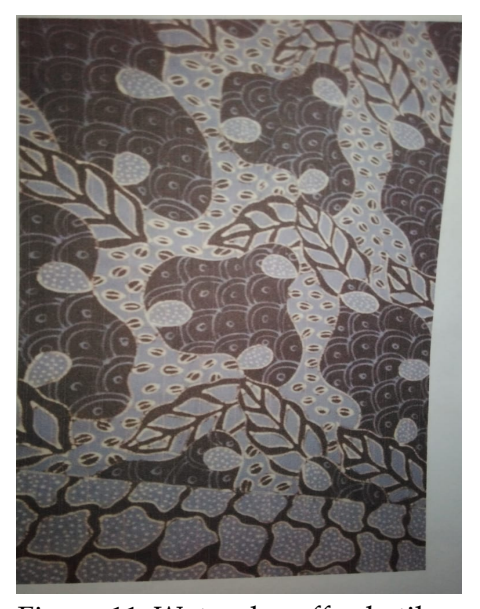
Figure 11. Watu ulo coffee batik motif

It shows that tobacco and cocoa are the superior products of the Jember Regency that are taken into account.