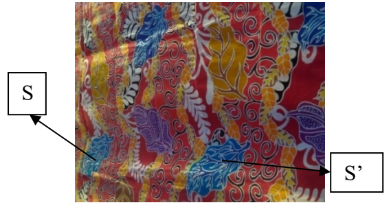
Figure 15a.Dilation on Motif (Batik Rolla Jember)

In making Jember batik motifs there is a concept of dilation. The concept of dilation is meant to duplicate the batik motif but in different sizes. Then put together a Jemebr batik motif so that it looks more beautiful. Examples of Jember batik motifs that have a dilation concept are shown in Figure 15a. and Figure 15b.