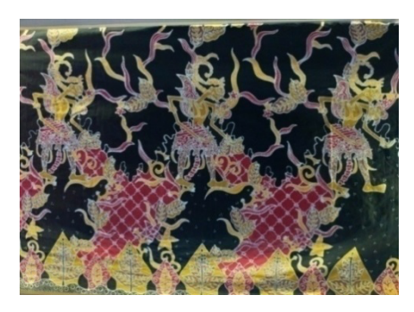
Figure 2. Jember puppet batik motif

Mathematical Batik Motif has mathematical meaning because it contains mathematical elements, namely squares. Inside the square is a tobacco motif that is crossed so that each side is the same. So the form of mathematical motives is not just making it like a cube. However, the cube motif is combined with other batik motifs.