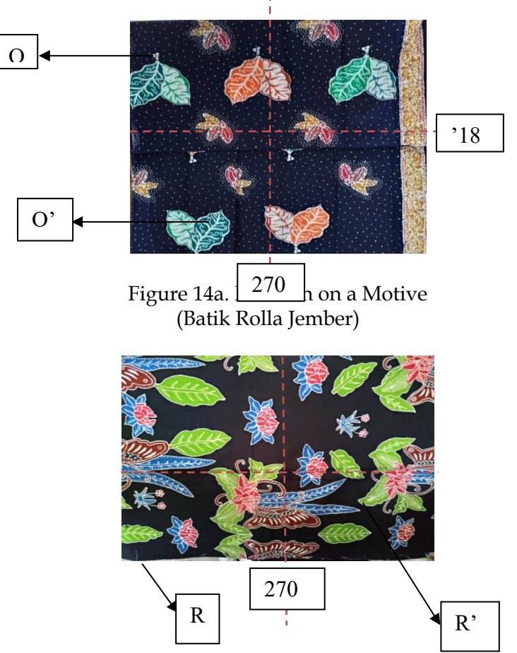
Figure 14b. Rotations on a Motive (Rezti'z batik Tegalsari Ambulu)

In making Jember batik motifs there is also a rotation concept. The concept of rotation is obtained by rotating the motif made according to the axis. An example of the rotation concept is shown in Figure 14a. and Figure 14b.. in Figure 14a. the motif is mirrored horizontally, not much different in Figure 14b. the batik motif is reflected horizontally.