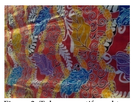
Figure 3. Tobacco motifs and types,

The Jember puppet batik motif shows the culture because there are wayang motifs. So in this motif, there is a tobacco motif and there is a curtain/puppet screen. Then there is the puppet motif, which actually comes from the Jogja area. The standard is Jogja wayang using lurik and truntum. Lurik is a cloth with a small striped motif which has traditionally been the typical clothing of rural men among Javanese ethnic groups, while trumtum, is a typical Jogja batik motif created by Kanjeng Ratu Kencana (Permaisuri Sunan Paku Buwana III). Because this puppet is placed in the Jember batik motif so that it is combined and matched using tobacco.