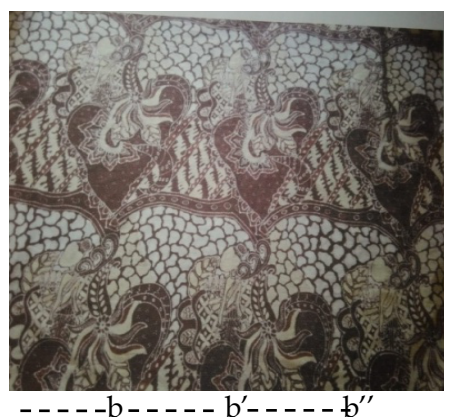
Figure 13b. Translation on the Motive (Rezti'z batik TegalsariAmbulu)