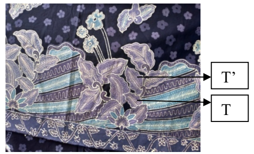
Figure 15b. Dilation on Motif (Rezti'z batik TegalsariAmbulu)

In Figure 15a., the S batik motif becomes a batik S 'motif. The same is the case in Figure 15b. the T batik motif when it is dilated it becomes the T 'batik motif. So it can be concluded that the Jember batik motif has the concept of Dilatation