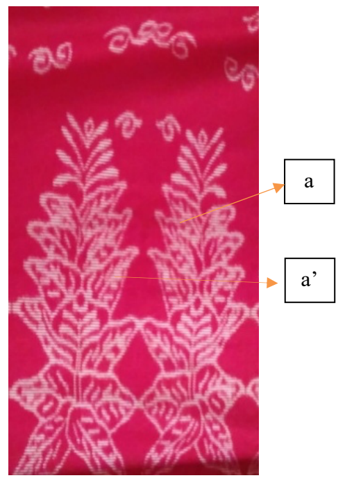
Figure 12a. Reflection on the Motive (Batik Rolla Jember)

The making of batik motifs in Figure A.1 and Figure A.2 contains the concept of reflection, this is evidenced by the location of the motif