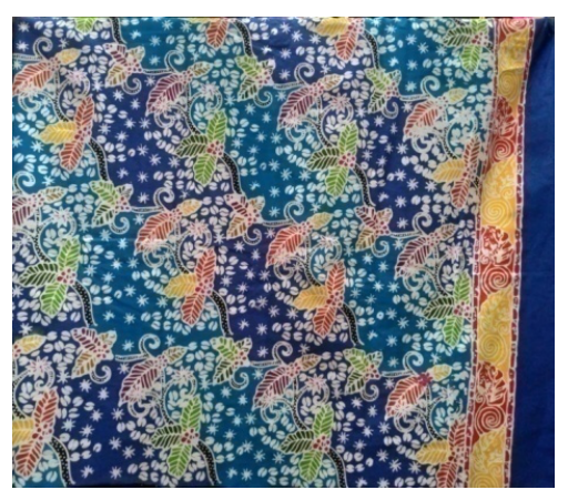
Figure 8. Coffee batik motifs

Besides Batik Batik Motif, Jember also has other typical Jember batik motifs, namely coffee. Similar to the Tobacco batik motif, the Kopi batik motif is also produced in the two Jember Batik Production Houses, namely Rolla Jember Batik House and Rezti's Batik Tegalsari Ambulu Jember.