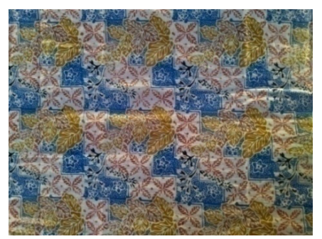
Figure 1. Mathematical batik motifs

Mathematical Batik Motif has mathematical meaning because it contains mathematical elements, namely squares. Inside the square is a tobacco motif that is crossed so that each side is the same. So the form of mathematical motives is not just making it like a cube. However, the cube motif is combined with other batik motifs.