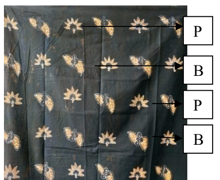
Figure 16b. Pattern of Numbers on Motifs (Rezti'z batik Tegalsari Ambulu)

In Figure 16a., the batik motif of the batik motif p is 1 with the batik B motif so that it can be said that the batik has a 1-1 pattern. Likewise in Figure 16b, the batik motif P is patterned 1-1 after the batik motif B. So it can be concluded that the Jember batik motif contains the concept of a number pattern. In my research, there are several philosophical values in Jember batik motifs. At the Rolla Jember batik house, most of the philosophical values contained in the Jember batik motif are tobacco leaves, coffee, and cocoa. Not much different in Rezti'z batik Tegalsari Ambulu Jember, the Jember batik motif produced has a philosophical value, namely the batik motifs of tobacco leaves, coffee, and cocoa. The Jember batik motif shows a mathematical concept. Mathematical concepts are concepts in mathematics that are arranged hierarchically, structured, logically, and systematically starting from simple concepts to complex concepts.