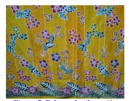
Figure 5. Tobacco batik motifs

In the tobacco batik motif which means prosperity. The tobacco coffee motif means the prosperity of the country, because coffee and tobacco typical of Jember itself, when exported, have high prices so that they become excellent in the eyes of the world.