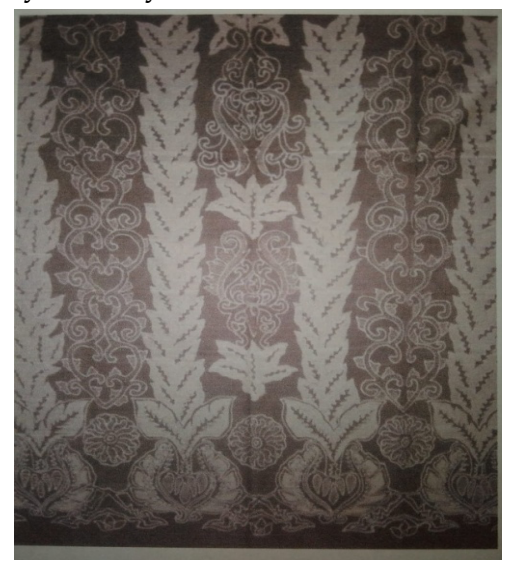
Figure 7. The batik motif of Na Oogst Serenteng

The batik motif Na Oogst Serenteng means Na Oogst which is the leading type of tobacco in Jember Regency which is commonly used as a binding wrapper and to fill the aroma of high-quality cigars, renting which means a series. So that this batik motif has a philosophical value to become a quality human being, of course, it must be able to go through a series of continuous learning processes, depicted with Na Oogst tobacco which is strung together.