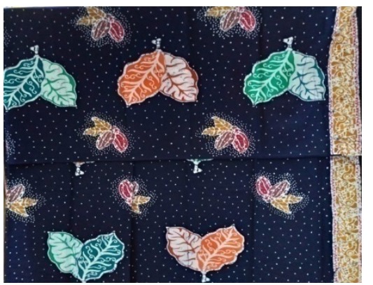
Figure 10. Coffee and cocoa batik motifs

In the tobacco batik motif which means prosperity. The tobacco coffee motif means the prosperity of the country, because Jember coffee itself, when exported, has a high price so that it becomes excellent in the eyes of the world.