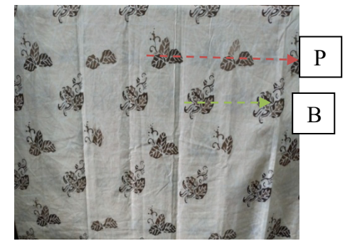
Figure 16a. Number Pattern on Motif (Batik Rolla Jember)

In the making of Jember batik motifs, there is also the application of the concept of numbers. This is shown in Figure 16a. and Figure 16b. In Figure 16a. there are different kinds of motifs with regular patterns, namely 1-1 patterns as well as in Figure 16b. there are 2 batik motifs with regular patterns, namely 1-1.