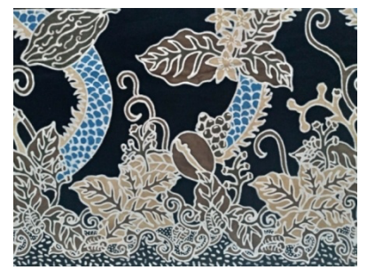
Figure 4. Tobacco coffee batik motif

tobacco. In this batik, the tobacco motif is made with the art, not only in the form of a single tree.