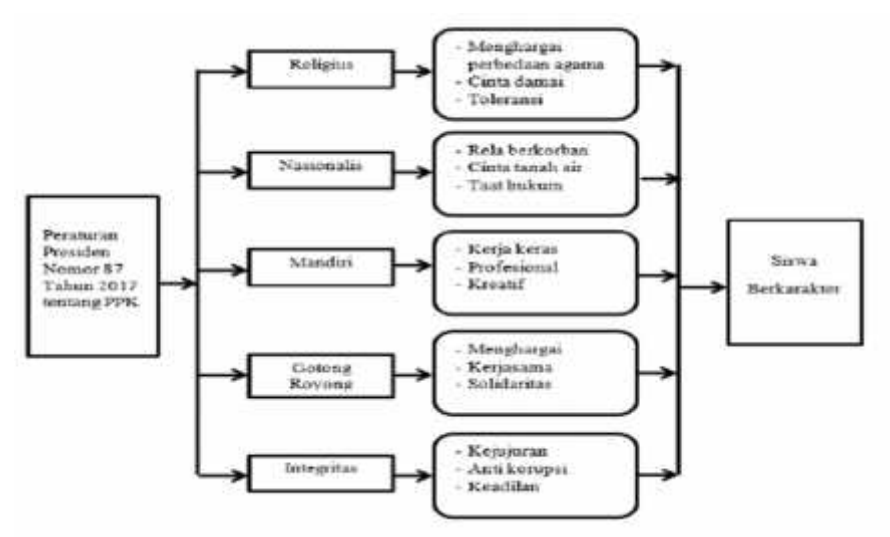
Figure 3. Dimensions Strengthening Character Education<sup>32</sup>

explained about the dimensions of each reinforcement value of character education.