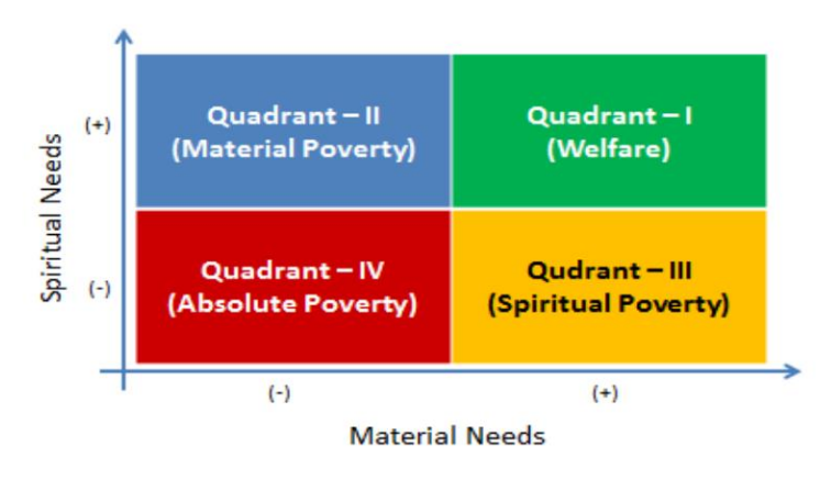
Figure 2. The CIBEST quadrant

The Center of Islamic Business and Economic Study (CIBEST) model was designed and developed by Beik and Arsyianti (2015). Measurements are carried out comprehensively, covering both material and spiritual aspects, which refer to Al-Quran and Sunnah. The household is the unit of analysis in the CIBEST model (Beik, 2015). The household is divided into four situations, which may be related to its ability to meet material and spiritual needs. This is illustrated in Fig. 2.