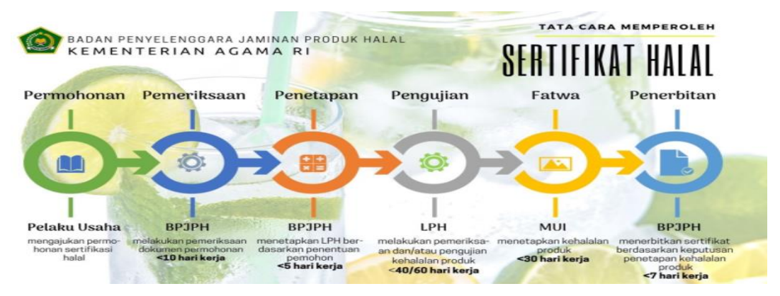
Figure 1. The Halal Certification Procedure

Producers can apply for product certification through the procedure stages as stated in the Halal Assurance System (HAS). The Halal Assurance System is a mechanism that producers must implement when applying for halal certification, which includes 11 halal criteria before being tested at LPPOM MUI. Recognition of the halalness of products by MUI guarantees Muslim and non-Muslim consumers of the halalness of the product, in order to provide a sense of security and calm in consuming the product (Baharuddin, et al. 2015). Consciousness of halalness will have a positive influence on consumers' desire to buy and use (Hapsari et al. , 2019). The halal certification procedure implemented by BPJPH are the following stages: