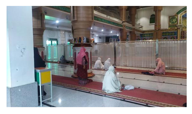
Figure 9. Women's prayer room.