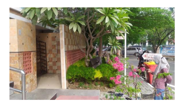
Figure 5. Toilets and places for women's ablution from door 1 (one).