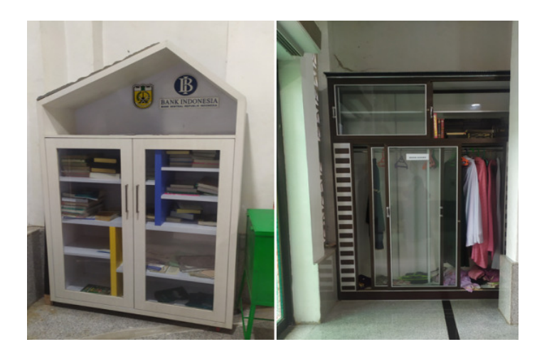
Figure 10. Al-Qur'an and Mukena in the women's prayer room.