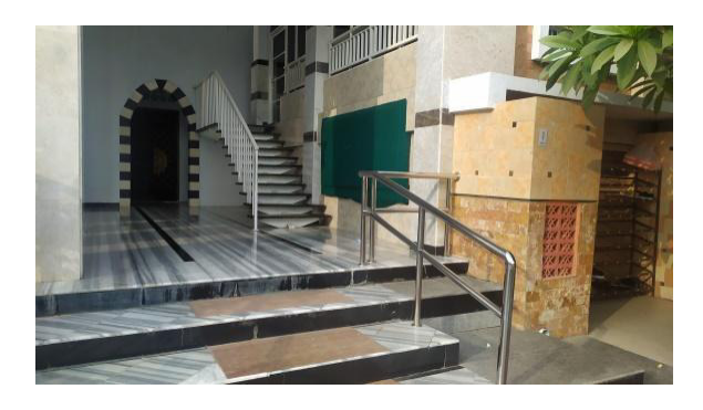
Figure 4. The entrance to the prayer room for men and women without passing through the place of ablution.