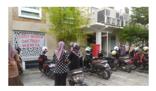
Figure 6. Toilets and places for women's ablution from door 2 (two).