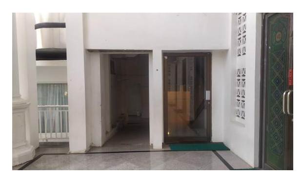
Figure 7. The entrance that is connected to the toilet and the place for women's ablution leads to the women's prayer room.