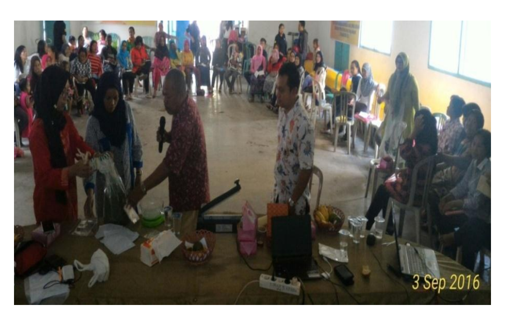
Figure 2. Tutorial for Packaging

In order to provide packaging-making skills, participants were asked to practice how to do good packaging. Good packaging requires supporting tools such as electric scales, siller machines, adequate plastics, attractive brands etc (Han, Ruiz-Garcia, Qian, & Yang, 2018). To make attractive packaging for this food product, we provide equipment assistance in the form of two units of Hand Sealer / Impulse Sealer machines (large and small sizes). This machine is used to glue the plastic on the side so that the packaging can be tightly closed. With the help of this equipment, it is hoped that it can save time and make the packaging look tidier. Previously, this kemplang product home industry entrepreneur only used staples and ordinary ropes to glue the packaging.