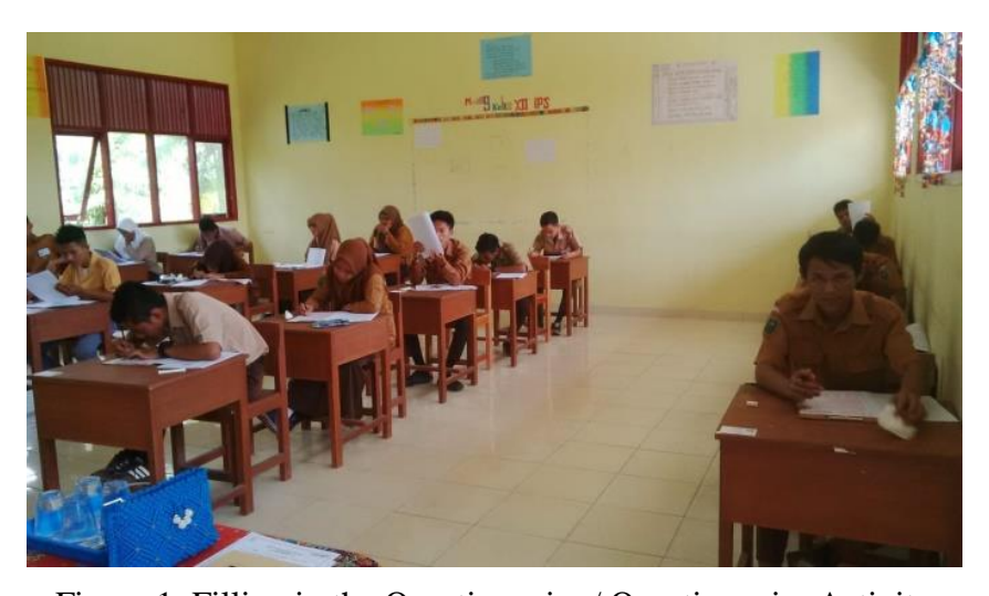
Figure 1. Filling in the Questionnaire / Questionnaire Activity

The photo in Figure 1 is an activity during the study of learning outcomes at SMAN 2 Kampar Left Tengah to determine the level of achievement of learning outcomes in the place where the author conducted research. This research was conducted by distributing questionnaires to students or respondents.