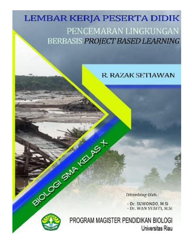
Figure 1. Cover Of Project-Based Learning Student Worksheets On Environmental Pollution Material

The existence of Student Worksheets is very helpful for students in understanding various basic concepts of the material by further developing problem solving skills. This is supported by the statement put forward by Paidi (2011) that the complex problems that exist in LKPD have the potential to train students' abilities to solve authentic problems and find alternative solutions (Figure 1).