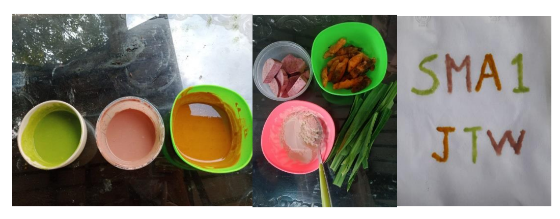
Figure 4. Documentation of Students' Creative Work in Making Nature Paint

Based on Table 2, the obtained score overall average the suitability of learning activities with Williams' sub-indicators of creativity was 92.8%, where according to Riduwan (2015)'s interpretation was categorized as Very Strong. The results of an internal feasibility test by two experts and one senior teacher, as well as an external feasibility test involving three high school students in Class XI, showed that the RADEC model colloidal learning design with the STEM approach was based on Google classroom could improve student creativity.