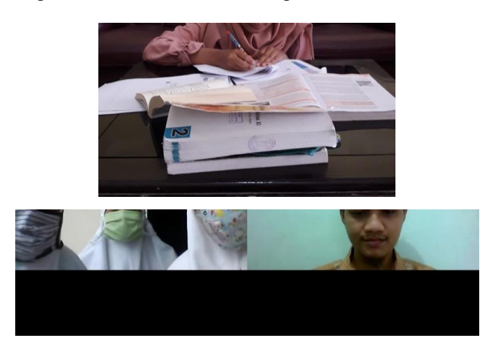
Figure 1. Student Learning Activities at Home in the Read and Answer Stages (above). Student Learning Activities in Virtual Classrooms at the Discuss, Explain, and Create Stages (below).

Table 1. showed that the RADEC model colloidal learning design with the STEM approach based on Google Classroom consisted of 5 stages; some documentation of student learning activities was shown in Figure 1.