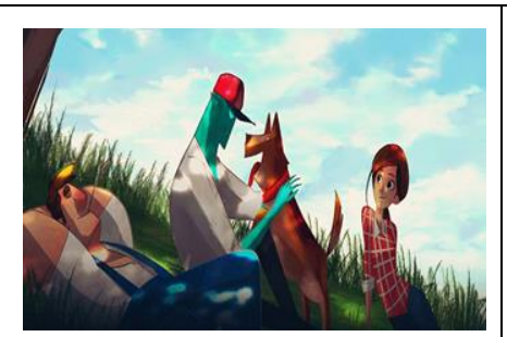
Figure 3 and 4: This is extradiegetic level. This picture is not the beginning of the story, it is seen from the narrator showing the characters. The reader can see that the shadow in the first picture that is not real human, but Alien. They are not afraid and they join the Alien happily.

The picture contains metalepsis; the character has faced the next level.