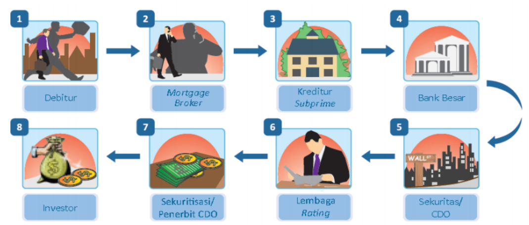
Figure 1. Chronology of Global Financial in 2008

export performance is depressed due to falling prices which have a negative impact, mainly on countries exporting natural resource commodities (SDA). As for the financial transaction channel, the impact of the global financial crisis (GFC) spread to the Asian region due to the decline in the stock market and the depreciating exchange rate. Banking as a financial sector is certainly one of the elements affected by this crisis. Bank Indonesia described the situation at that time in the following infographics: