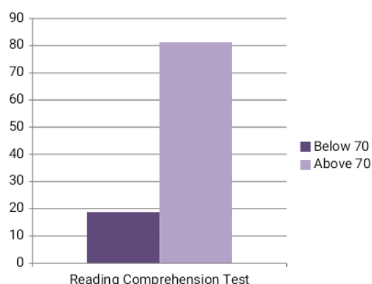
Figure 2: The Result of Reading Comprehension Test

joined the test, all of them had improvement in reading comprehension achievement if compared with the comprehension result in preliminary study, there was improvement of the students' average score, from 55 to 74.68 and number of students who passed minimal passing grade, from 8 to 26 students. Besides, all of low achievers in preliminary study, 24 students (100%) made improvement 13 points or more and all of high achievers, 8 students (100%) got 7 points as their improvement. Figure 3 presented the result of the students' reading comprehension test.