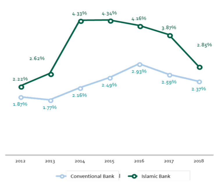
Graph 2. Non-Performing Financing of Islamic Banks Versus Conventional Banks