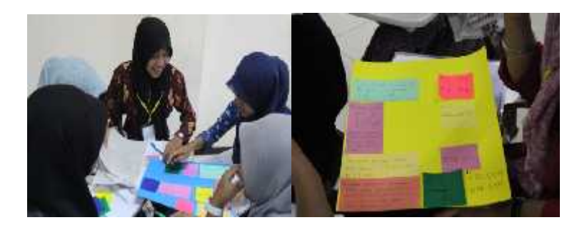
Figure 6. Student check their final answer

Once students are done, check to make sure the numbers really work by plugging them back into the original conditions. The alternative answers that have been obtained by each group has a different way of reference and different for each group. So when it has a difference by each group of teachers need to consider whether the means used was appropriate or not. Restore step by step do need to figure out which one has the most appropriate alternative answers.