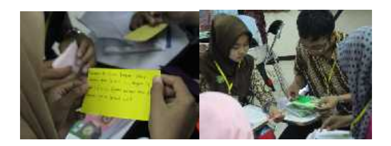
Figure 2. student determined what they try to find

Determine what number students are comparing to. The results of what they get together group of their friends then compared with the results conducted by other groups, whether of the discussion draft is done and the results of the search of alternative answer to the problem is provided. This process needs to be done so that what they do does have a truth value or not