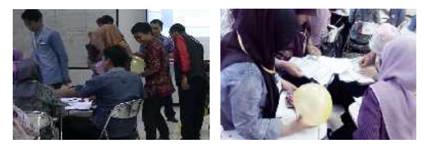
Figure 9. Students blow up the balloon which is take the problem inside previously