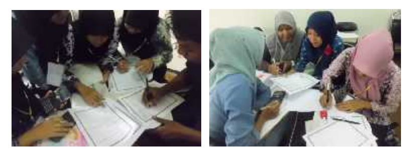
Figure 8. Students discuss with their group about creating one problem and an answer key for it