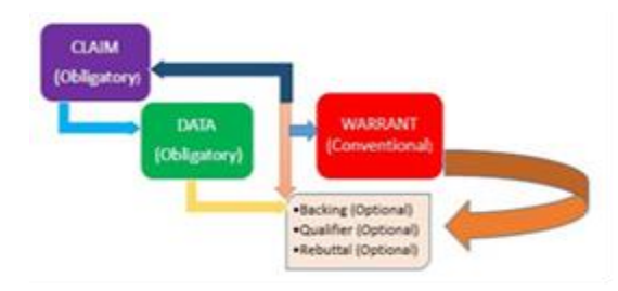
Figure 4: The Structure of Strong Argument Structure

From the example above, claim and data are used as the element of the argument. Claim is shown from the presence of the sentence "education has a complementary role to play" the author attempt to convey the claim of fact proven by the following data after the claim. It consists of telling details shown by the words "firstly, secondly" and example shown by the words "for instance". This structure is indicated as the simplest structure where the author only put a claim and relevant justification regarding to the topic given.