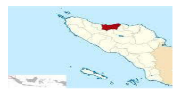
Figure 1.1: Bireuen Regency, NAD Maps