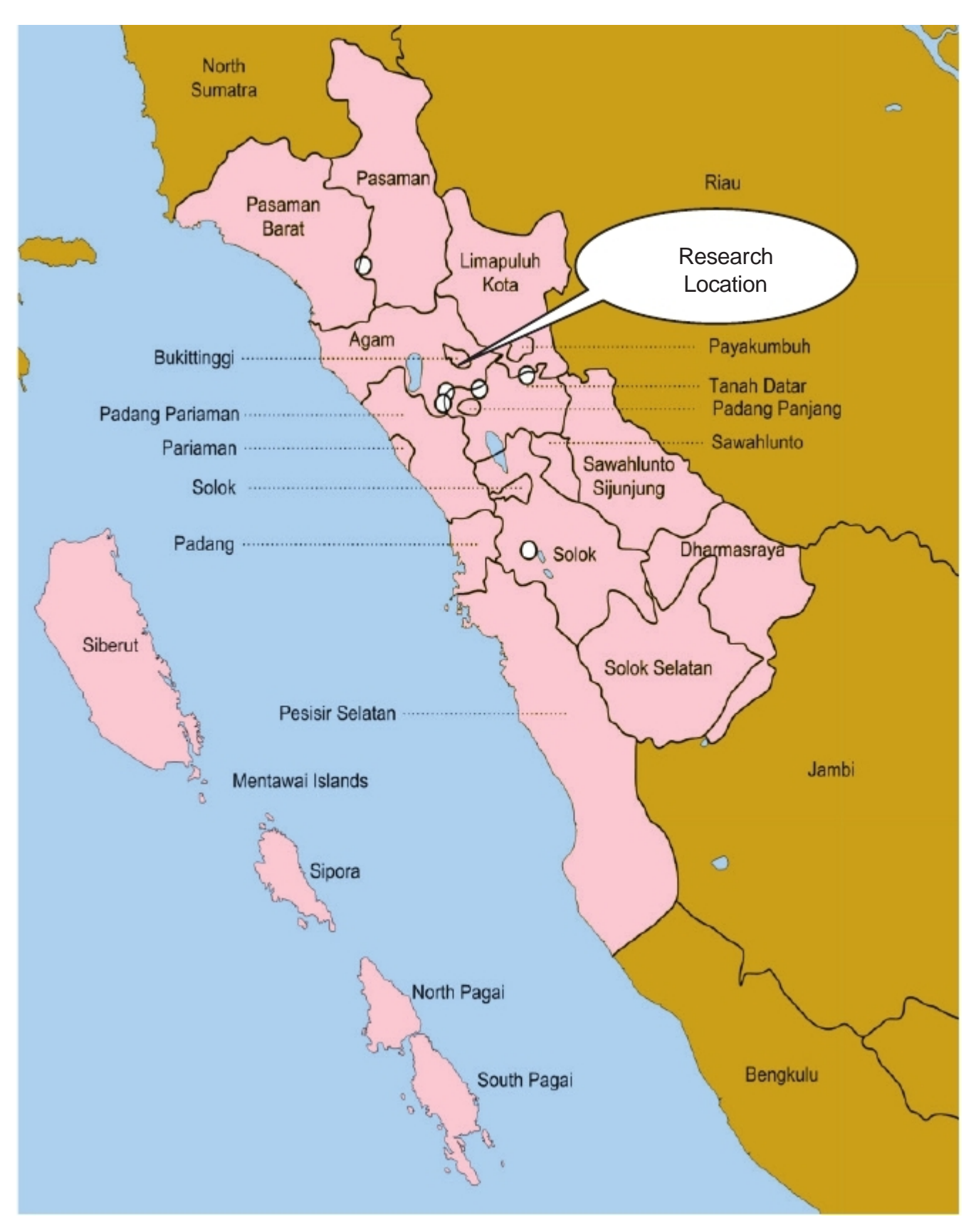
Map: Province of West Sumatra and Research Location.