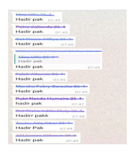
Figure 2 Student Attendance

The first thing that can also be done in implementing whatsapp-based PBI learning model is to be able to create groups from whatsapp classes. Learning is carried out once the material is delivered in the form of leaves. When the learning starts students do attendance in whatsApp groups by taking self and writing the word "Present" then by doing so the learners are considered to be present in the learning activities. In Figure 1 the following is the format of student attendance results through whatsApp groups.