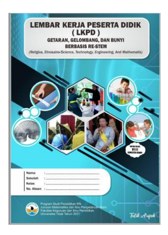
Figure 2. Product RE-STEM Worksheet

The material for cengklungan music in the worksheet also contains religious character values such as gratitude, praying to God, and balancing life in the world and the hereafter. The research of Paramartha et al. (2020) states that the integration of the local wisdom values in learning is necessarily carried out because it contains moral values, especially nationalism and religious attitudes.