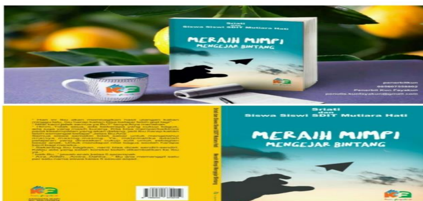
Fig 2. Students' first work

students afterward. There have been 4 books published since the first study tour was held until 2020. Some of the published works are: 1) Achieving The Dream of Chasing Stars, 2) KISPEN (Short Story of the Jogja-Malaysia-Singapore Study Tour), 3) Every step has a story, 4) Malaysia is cheerful, Jogja is extraordinary. Some of the published works can be viewed through the following images.