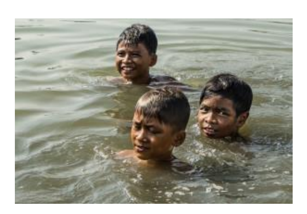
Figure 7. Source: www.globeslice.com

"Every weekend, Arif ... (go/goes/went/gone) swimming in the Ciliwung river."