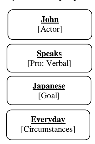
Figure 2 Sample of Data Coding

textual data presented on the exercises. The researcher focused on analyzing the actors, processes, and circumstances in each sentences or phrases of the English grammar exercises. For example, John speaks Japanese everyday.